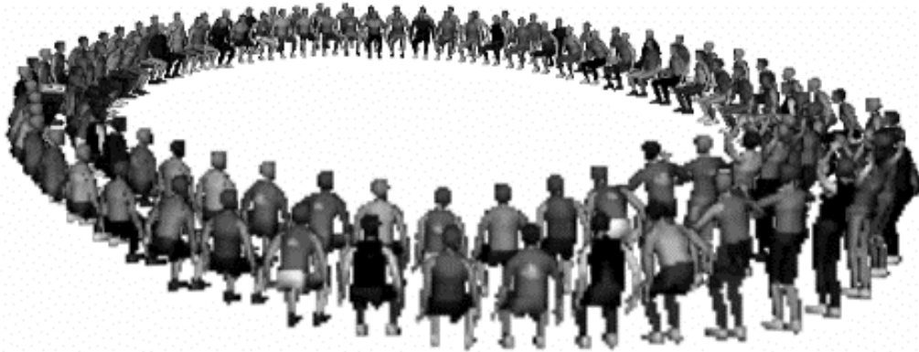
Fig.5. Use of Impostors

intrinsic temporal coherence of the animation. Current graphics systems rarely take advantage of temporal coherence during animation. Yet, changes from frame to frame in a static scene are typically very small, which can obviously be exploited [23]. This still holds true for moving objects such as virtual humans providing that the motion remains slow in comparison with the graphics frame rate. Aubel and Thalmann [24] propose an approach to accelerated rendering of moving, articulated characters, which could easily be extended to any moving and/or self-deforming object. The method is based on impostors, a combination of traditional level-of-detail techniques and image-based rendering and relies on the principle of temporal coherence. It does not require special hardware (except texture mapping and Z-buffering capabilities, which are commonplace on high-end workstations nowadays) though fast texture paging and frame buffer texturing is desirable for optimal performance.