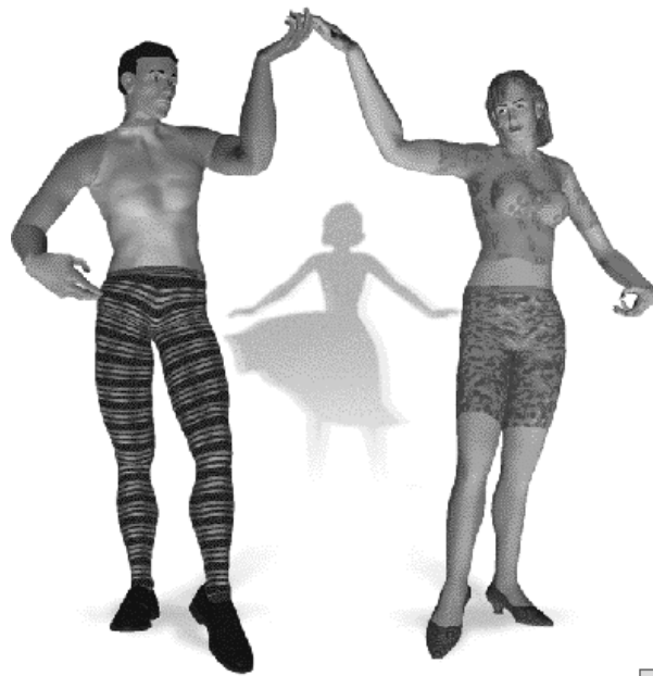
Fig.1 Virtual Humans

But, the modelling of Virtual Humans is an immense challenge as it requires to solve many problems in various areas. Table 1 shows the various aspects of research in Virtual Human Technology. Each aspects will be detailed and the problems to solve will be identified.